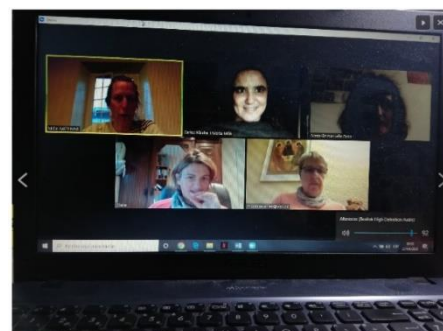
Capture d'écran 2020-05-19 à 11.18.16 Image 2 sur 2

One CLCer wrote: 'Holy Spirit and Christ visited us through The Word and faith-sharing, through fraternity and a quick sense of solidarity, a comfortable intimacy as we just 'jumped in' with one another because of our shared Ignatian spirituality and way of proceeding. It has been a wonderful experience for each of us spiritual, human, and active and incredible that we met at this moment of human history amidst the global pandemic. Our brief journey has been a broadening of our hearts and minds, engaging four different cultures, mentalities, perceptions of the world around. It did not only deepen my sense of CVX-CLC, but also all of us as the Body of the Holy Universal Church'